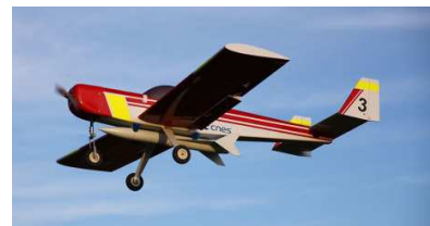
Figure 4: Mini Remote Piloted aircraft

Beside the EOLE large demonstrator, at a smaller scale a lot of experiments more open to students can be undertaken. This project is coordinated by Planète Sciences Partner. The purpose is to operate remote piloted airplane in order to test the release of a mini rocket in automatic mode. Despite the small scale (3 m wingspan) of these demonstrators the compliance with the regulation in force is imposed. The payload weight is 4 kg.