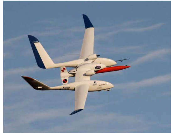
Figure 3: EOLE carrying an ARES rocket

automatically release the rocket and ignite it safely. Some discussions are still pending with the compatible launch site, which should result on an agreement for this global demonstration, opening the way for other tests on future separation and release system developed by students.