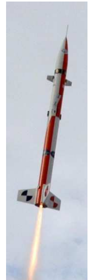
Figure 1: ARES launch at C'Space