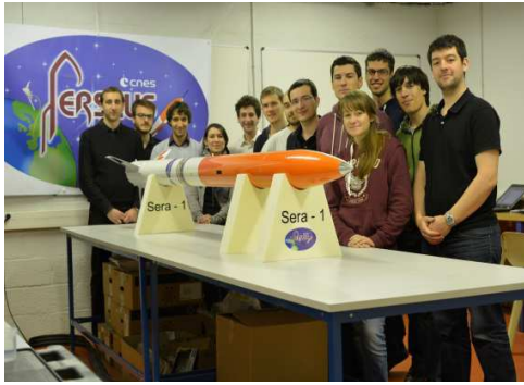
Figure 2: SERA integration before packing to Sweden

performance enables to demonstrate that the PERSEUS project masters the classical dimensioning cases encountered for the development of an operational space launcher during its atmospheric phase, that is to say: lift off, Q_{max} , transonic regime and acceleration not higher than 10g.