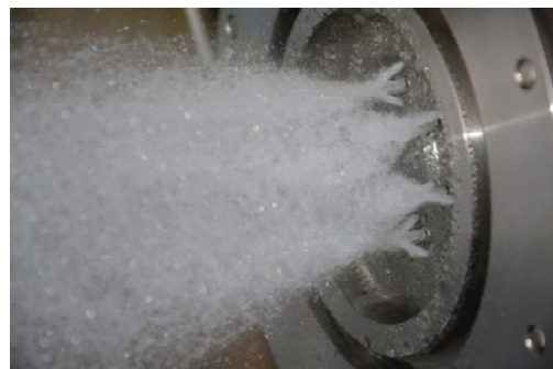
Figure 6: water test of the injecting plate.

Several water tests were performed at the Martel facilities in Poitiers. These rather simple tests enable to check the correct rate flow, the mixing plume shape and any leakage in the injection dome.